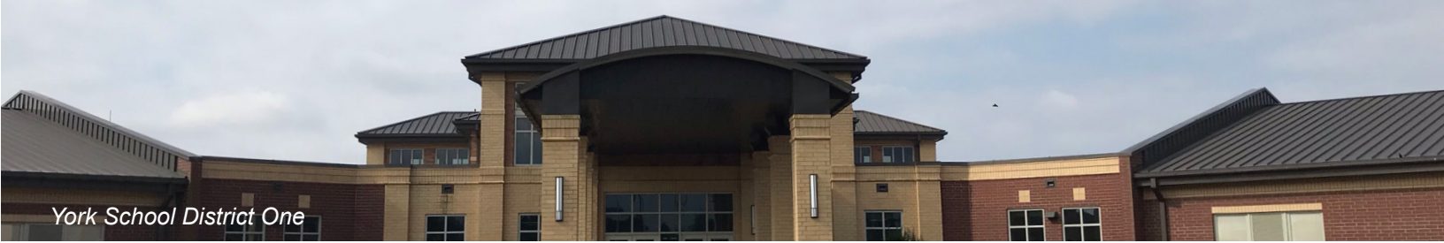
York School District One